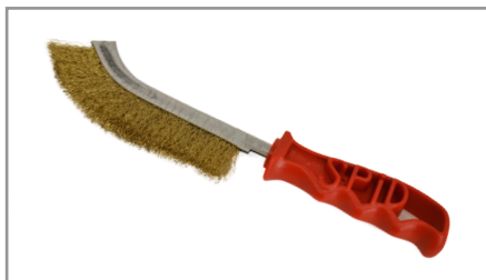
Panini Grill Cleaning Brush